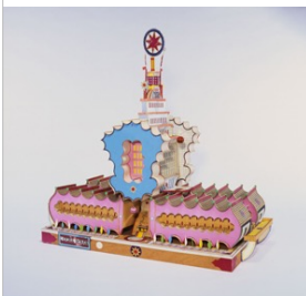
Bodys Isek Kingelez Étoile Rouge Congolaise, 1990 85 x 92 x 50 cm Paper, cardboard, polystyrene, plastic, and found material Courtesy C.A.A.C-The Pigozzi Collection, Geneva © Bodys Isek Kingelez