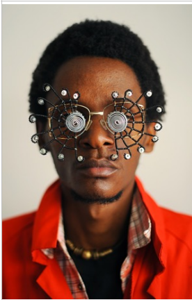
J.D. 'Okhai Ojeikere Onile Gogoro o Akaba (Onile Gogoro Or Akaba From the series Haistyles , 1975 50 x 50 cm Gelatin silver print