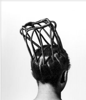
J.D. 'Okhai Ojeikere Onile Gogoro o Akaba (Onile Gogoro Or Akaba From the series Haistyles , 1975 50 x 50 cm Gelatin silver print