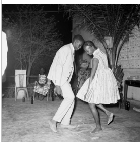
Malick Sidibé Nuit de Noël (Happy Club), 1963 40 x 40 cm Gelatin silver print Courtesy CAAC. Courtesy Magnin-A Gallery, Paris © Malick Sidibé