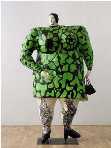
Niki de Saint Phalle Madam or Green Nana with Black Bag (Madame ou Nana verte au sac noir) , 1968

Fabric, toys, various objects, and wire mesh 235 x 300 x 120 cm Sprengel Museum, Hanover, Gift of the artist, 2000 © Niki Charitable Art Foudation, Santee, USA