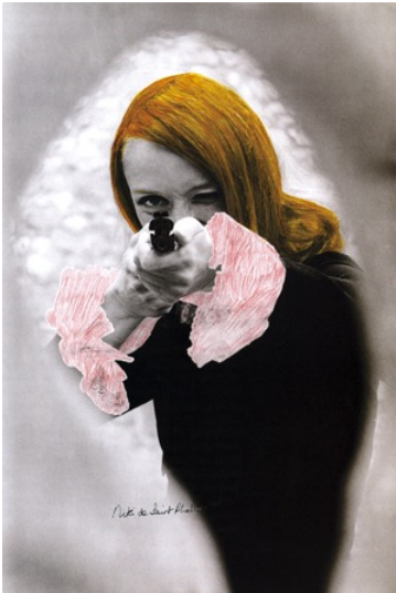
Niki de Saint Phalle pointing her gun, 1972

Black and white photograph with color retouching, still from the film Daddy