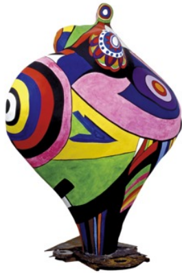
Niki de Saint Phalle Gwendolyn , 1966–90

Painted polyester on wire mesh 550 cm high Sprengel Museum, Hanover, Gift of the artist, 2000 © Niki Charitable Art Foudation, Santee, USA