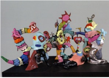
Niki de Saint Phalle Diana's Dream (Le Rêve de Diane) , 1970

Painted polyester 280 x 600 x 350 cm Niki Charitable Art Foudation, Santee, CA; USA © Niki Charitable Art Foudation, Santee, USA