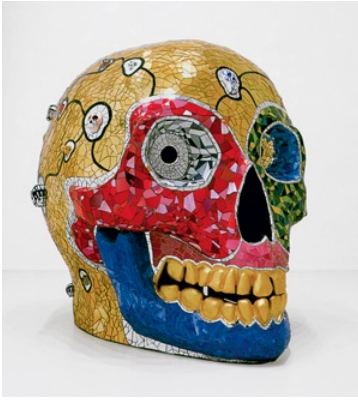
Niki de Saint Phalle Skull (Meditation Room) , 1990

Glass and mirror mosaic, ceramic, and gold leaf 230 x 310 x 210 cm Sprengel Museum, Hanover, Gift of the artist, 2000 © Niki Charitable Art Foudation, Santee, USA