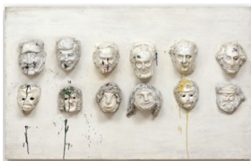
Niki de Saint Phalle Heads of State (Study for King Kong) , spring 1963

Paint, plaster, and various objects on conglomerate panel 143 x 77 x 7 cm Private collection, Courtesy Galerie G.-P. & N. Vallois, Paris © Niki Charitable Art Foudation, Santee, USA Photo: © Laurent Condominas