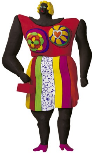
Niki de Saint Phalle Dolorès , 1966–95

Painted polyester on wire mesh 550 cm high Sprengel Museum, Hanover, Gift of the artist, 2000 © Niki Charitable Art Foudation, Santee, USA