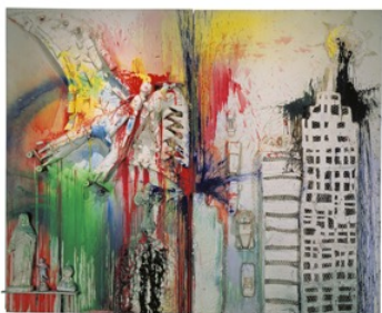
Niki de Saint Phalle Pirodactyl over New York , 1962

Paint and masks on wood panel 122.5 x 198 x 21 cm Sprengel Museum, Hanover, Gift of the artist, 2000 © 2014, Niki Charitable Art Foundation, Santee, USA