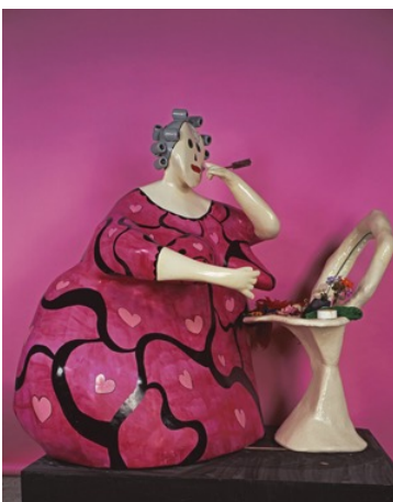
Niki de Saint Phalle The Toilette (La Toilette) , 1978

Painted polyester on metal frame 252 x 200 x 125 cm Edition 2/3 Sprengel Museum, Hanover, Gift of the artist, 2000 © Niki Charitable Art Foudation, Santee, USA