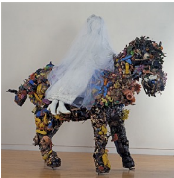
Niki de Saint Phalle The Horse and the Bride (Cheval et la Mariée) , 1963

Glass and mirror mosaic, ceramic, and gold leaf 230 x 310 x 210 cm Sprengel Museum, Hanover, Gift of the artist, 2000 © Niki Charitable Art Foudation, Santee, USA