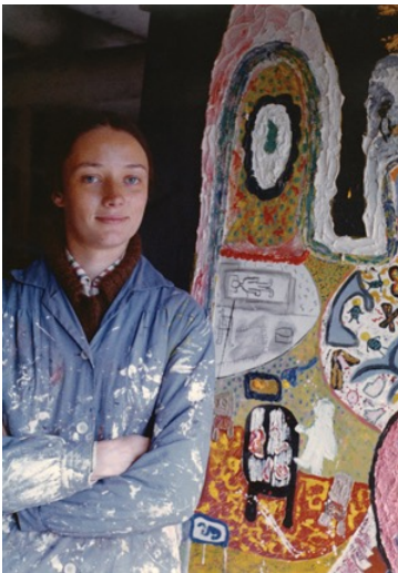
Niki de Saint Phalle in Deià, 1955

Photo: © Peter Whitehead © Niki Charitable Art Foudation, Santee, USA