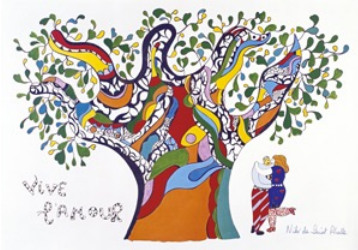
Niki de Saint Phalle Long Live Love (Vive l'Amour) , 1990

Painted polyester 280 x 600 x 350 cm Niki Charitable Art Foudation, Santee, CA; USA © Niki Charitable Art Foudation, Santee, USA