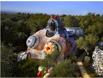
View of the Tarot Garden Garavicchio, Italy

Felt-pen and gouache on Bristol paper 45 x 55 cm Niki Charitable Art Foudation, Santee, CA; USA © Niki Charitable Art Foudation, Santee, USA