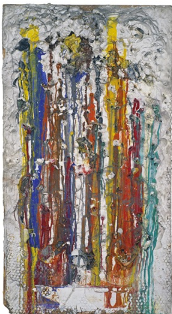
Niki de Saint Phalle Grand Shoot - J Gallery Session (Grand Tir – Séance galerie J) , 1961

Paint, plaster, and various objects on conglomerate panel 143 x 77 x 7 cm Private collection, Courtesy Galerie G.-P. & N. Vallois, Paris © Niki Charitable Art Foudation, Santee, USA Photo: © Laurent Condominas