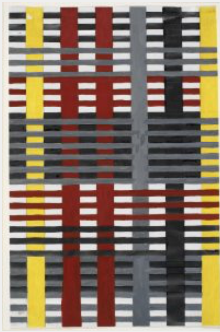
Anni Albers Study for Unexecuted Wallhanging, 1926 31.1 x 24.7 cm Gouache with pencil on photo offset paper The Josef and Anni Albers Foundation, Bethany CT