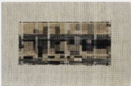
Anni Albers City, 1949 44.4 x 67.3 cm Linen and cotton The Josef and Anni Albers Foundation, Bethany CT