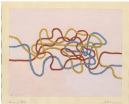
Anni Albers Knot, 1947 43.2 x 51 cm Gouache on paper The Josef and Anni Albers Foundation, Bethany CT