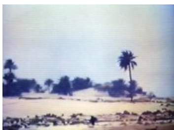
Chott el-Djerid (A Portrait in Light and Heat) , 1979 Videotape, color, mono sound; 28:00 minutes Courtesy Bill Viola Studio © Bill Viola Photo: Kira Perov