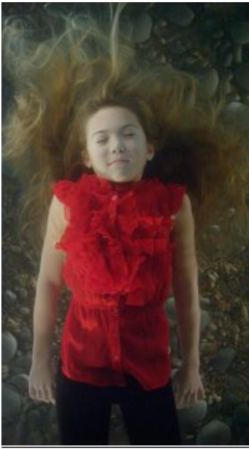
The Dreamers , 2013 (detail) Video/sound installation Continuously running Performer: Madison Corn Courtesy Bill Viola Studio © Bill Viola Photo: Kira Perov