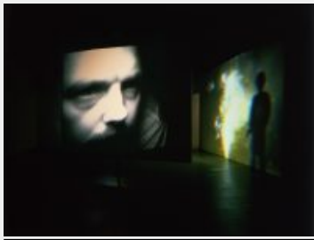
Slowly Turning Narrative , 1992 Video/sound installation Continuously running Courtesy Bill Viola Studio © Bill Viola Photo: Gary McKinnis