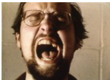
The Space Between the Teeth , 1976 From Four Songs , 1976 Videotape collection Color, mono sound; 33:00 minutes total

If you have any queries about image use please contact the Guggenheim Museum Bilbao Press Office at media@guggenheim-bilbao.es or call +34 944 359 008.