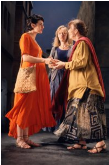
The Greeting , 1995 Video/sound installation 10:22 minutes Performers: Angela Black, Suzanne Peters, Bonnie Snyder Courtesy Bill Viola Studio © Bill Viola