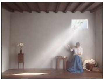
Catherine's Room , 2001 Color video polyptych on five flat panel displays 18:39 minutes Performer: Weba Garretson Courtesy Bill Viola Studio © Bill Viola Photo: Kira Perov