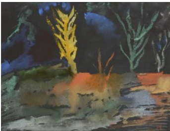
Henri Michaux Untitled, 1938 Watercolor and gouache on black paper 230 x 305 mm Private collection

If you have any queries about image use please contact the Guggenheim Museum Bilbao Press Office at media@guggenheim-bilbao.es or call +34 944 359 008.