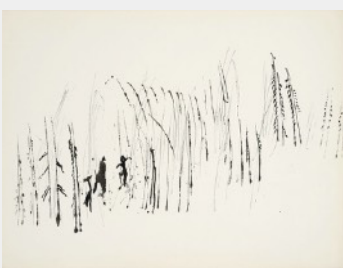
Henri Michaux Untitled, 1944 India ink on paper 240 x 320 mm Private collection