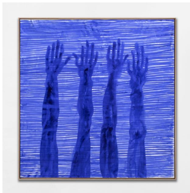
Partage VII , 2020, ink on canvas, 200 x 200 cm.

“This year marks the 30 th anniversary of the death of Edmond Jabès, the poet and writer of African (Egypt) origins. His work has never ceased to enlighten us. With his questions and formulations, Edmond Jabès is in harmony with my vision of the world, and his work resonates with my artistic practices. A complicity of thought emerged when reading his writings. Learning more about the world of Edmond Jabès, particularly his “ Livre du partage ” (the Book of Shares) inspired me to conceive an artistic proposal during the Busan 2020 International Biennale in Korea; this resulted in a series of 8 paintings entitled Partages I – VIII .