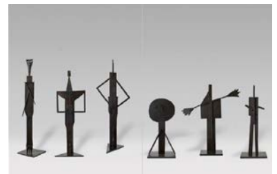
Photo © RMN-Grand Palais (Musée national Picasso-Paris) / Mathieu Rabeau

© Sucesión Pablo Picasso, VEGAP, Madrid, 2023